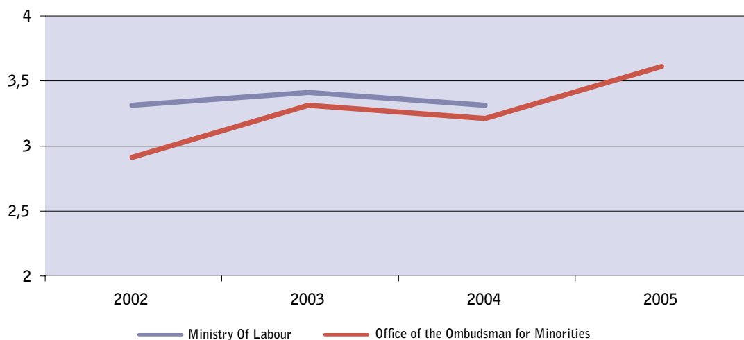
DEVELOPMENT OF WORK SATISFACTION IN 2002 – 2005

In addition to the weekly office meetings, the staff had four more extensive developmental meetings or seminar days. These events were used to go over the basic duties of the Ombudsman as his scope of activities broadened, methods of action, and priorities of action, as well as values. The increases in customer work and contacts also created the need to discuss the importance of customer service and its provision, as well as the functionality of the contact register.